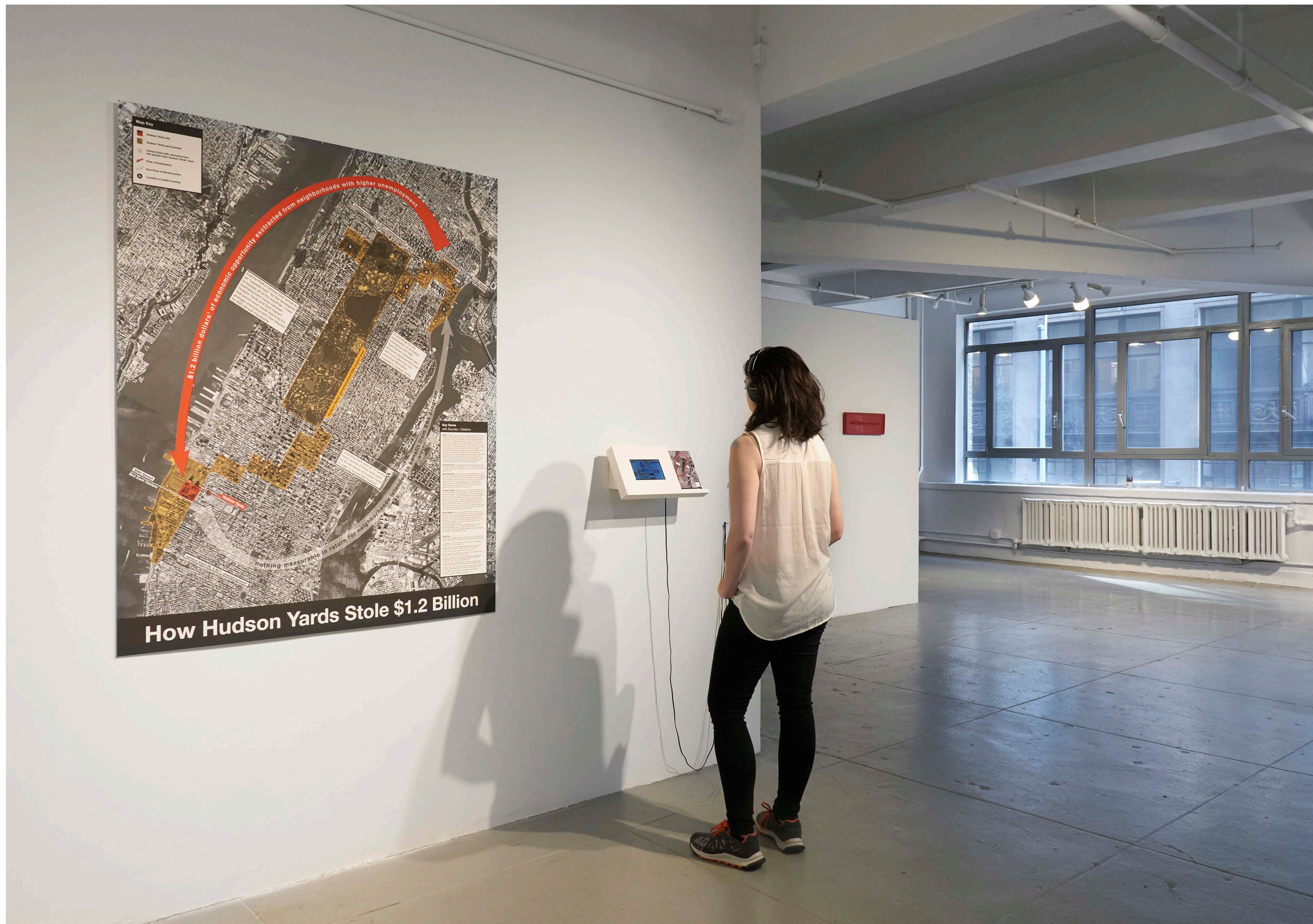
Andrew Sturm Not East Harlem: Mapping Economic Opportunity Theft 2019 - (work in progress)