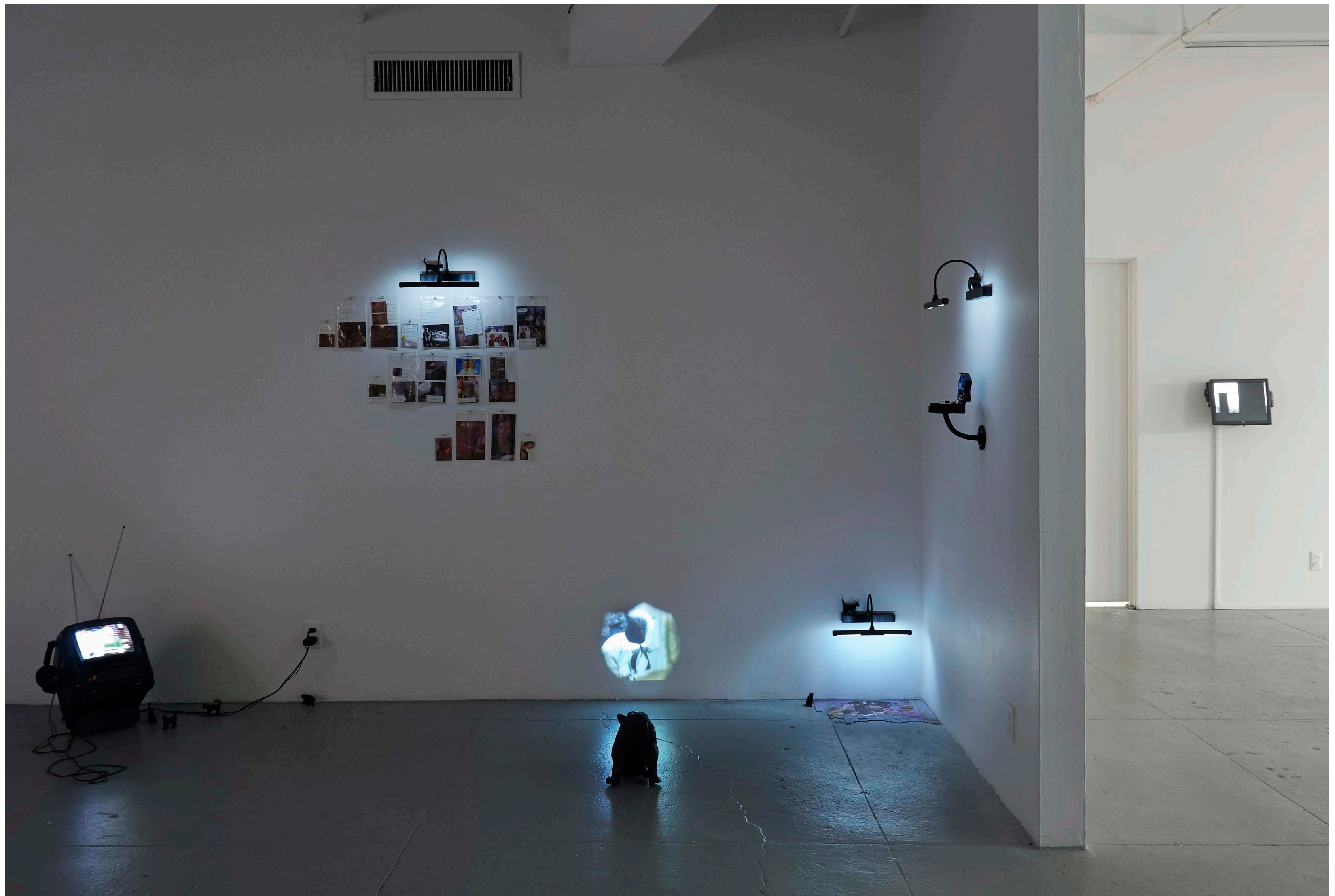
Rocío Olivares The Chilean Adventures of Sabrina 2019 - (work in progress)