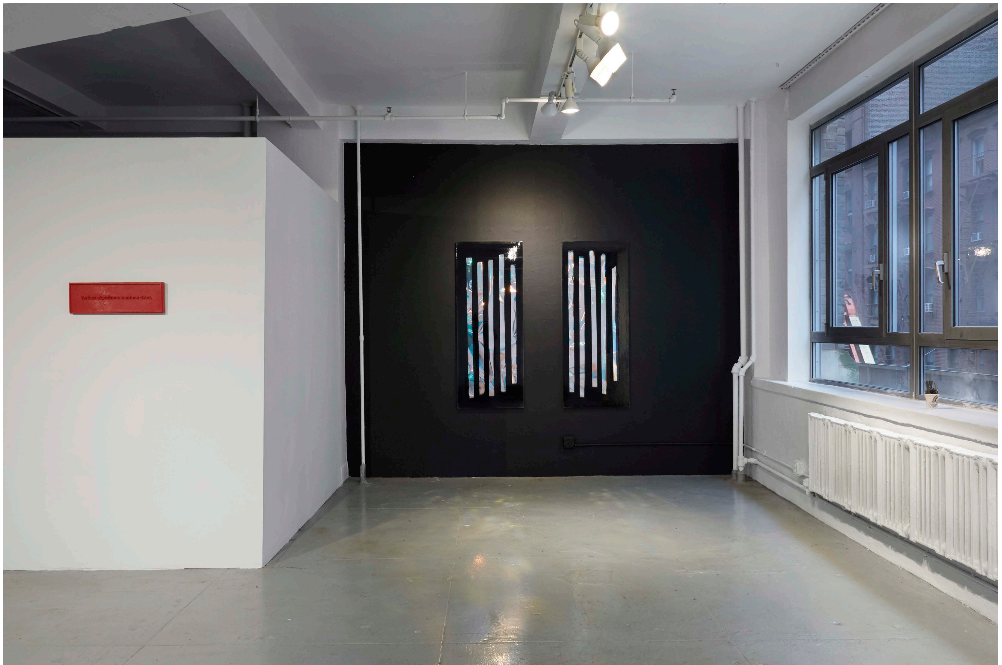
Coleman Collins red wax positive, lost 2019