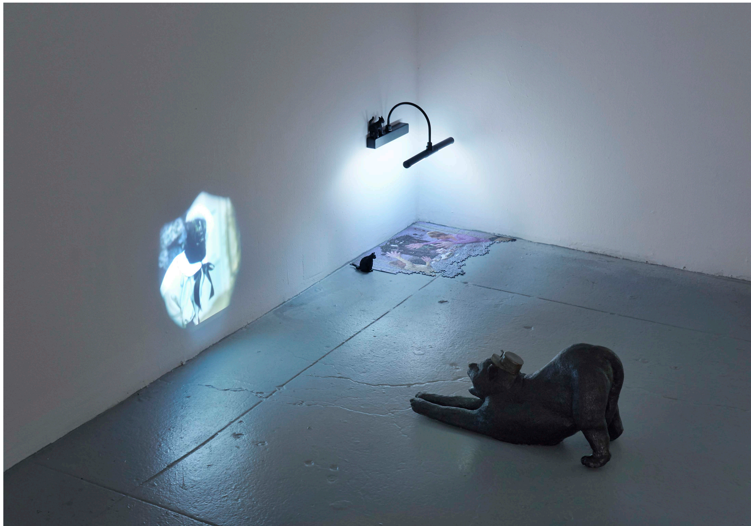
Rocío Olivares The Chilean Adventures of Sabrina 2019 - (work in progress)